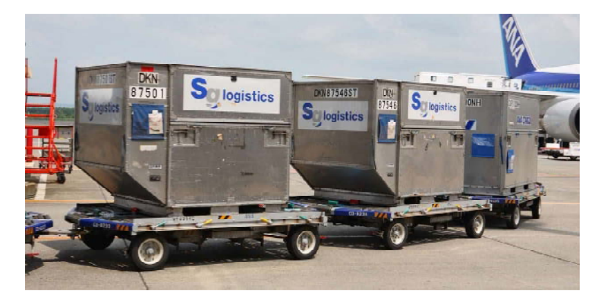
Fig 3.1: Unit Load Devices

pallets in position. Aircrafts that are wide bodied and narrow bodied use ULDs for the purpose of consolidating baggage or cargo items prior to loading into aircraft hold by specialised hydraulic lift equipment. The ULDs are then handled manually to the position on board utilizing roller floors before being secured in the position. ULDs must be either weighed, or the number of baggage items per container must be within a specified range and standard baggage unit weights applied.